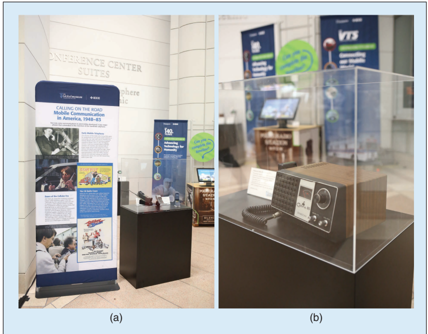
(a) and (b) Conference exhibit of historical milestones of the VTS and vehicular technology.

The 100th edition of the VTC featured dynamic keynote speakers and several panels, including a panel focusing on diversity, equity, and inclusion (DEI), which was a joint effort between the VTS Young Professionals Committee, the VTS