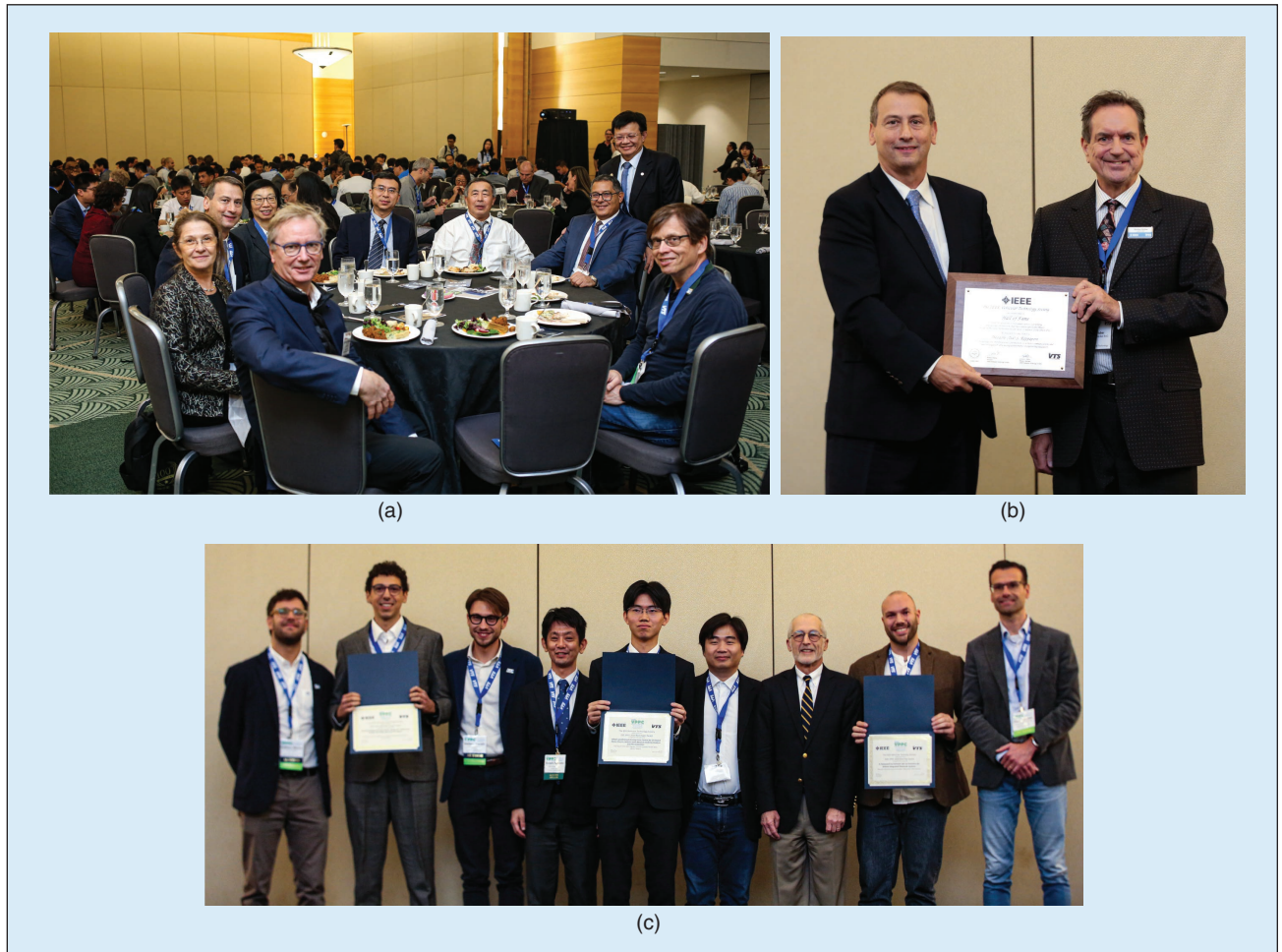
(a)-(c) At the VIP Recognition and Awards Luncheon held at VTC2024-Fall and VPPC 2024.